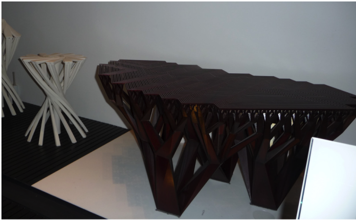
Figure 1-3. Make beautiful 3D-printed furniture and it may end up in the Victoria & Albert Museum's permanent collection