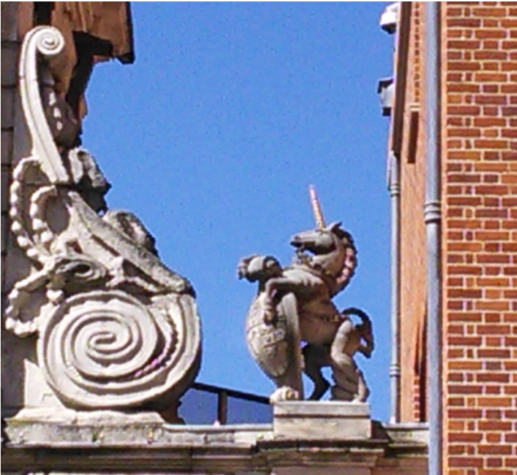
Figure 1-1. London does have unicorns

Finance, journalism, trade, the arts, government—London has been known as a world leader in these areas for centuries. Computer technology doesn't arouse such an immediate association with London, but since the mid-2000s it has steadily taken hold in all those